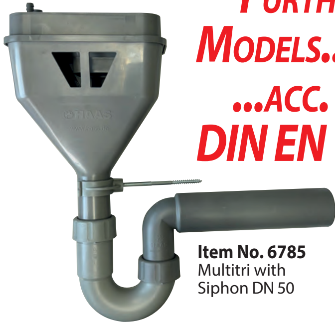
Item No. 6785 Multitri with Siphon DN 50

Since over 75 years quality & innovation for the plumbing trade.