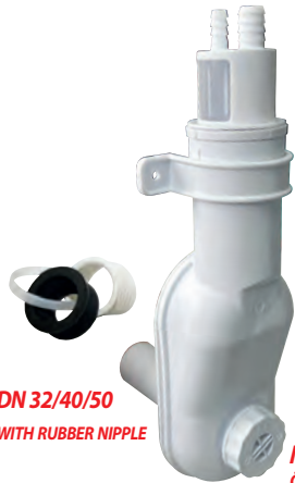
DN 32/40/50 WITH RUBBER NIPPLE

Wastewater connection siphon with rubber nipple for drain pipe DN 32/40/50 and two hose connections in 8 mm and 12 mm flowrate: 8 mm Nozzle = 800 l/h, 12 mm Nozzle = 1300 l/h and 8 and 12 mm Nozzle = 1500 l/h