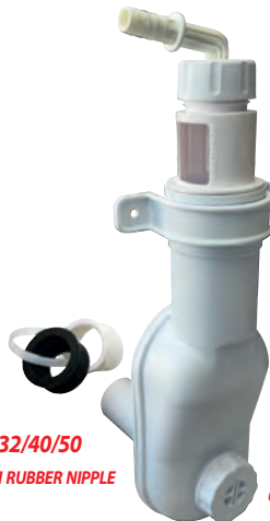
DN 32/40/50 WITH RUBBER NIPPLE

Wastewater connection siphon with rubber nipple for drain pipe DN 32/40/50 and angle hose nozzle in 10 mm (3/8"). flowrate: 10 mm Nozzle = 360 l/h