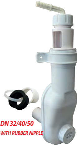
DN 32/40/50 WITH RUBBER NIPPLE

Wastewater connection siphon with rubber nipple for drain pipe DN 32/40/50 and angle hose nozzle in 8 mm. flowrate: 8 mm Nozzle = 360 l/h