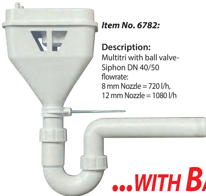
Item No. 6782:

Description: Multitri with ball valve- Siphon DN 40/50 flowrate: 8 mm Nozzle = 720 l/h, 12 mm Nozzle = 1080 l/h