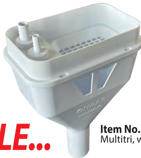
Item No. 6781 Multitri, white