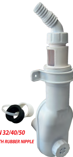
DN 32/40/50 WITH RUBBER NIPPLE

Wastewater connection siphon with rubber nipple for drain pipe DN 32/40/50 and angle hose nozzle in 19 mm to 23 mm (3/4" auf 1") with backflow preventer SAVE. flowrate: 19 mm Nozzle = 720 l/h