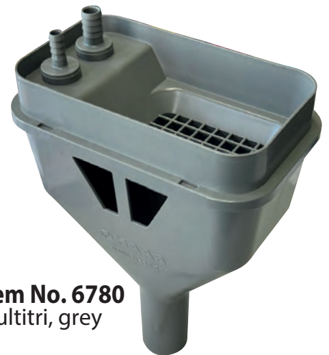
Item No. 6780 Multitri, grey