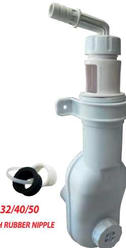
DN 32/40/50 WITH RUBBER NIPPLE

Wastewater connection siphon with rubber nipple for drain pipe DN 32/40/50 and angle hose nozzle in 12 mm (1/2"). flowrate: 12 mm Nozzle = 360 l/h