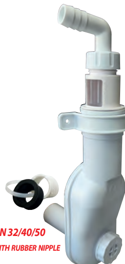
DN 32/40/50 WITH RUBBER NIPPLE

Wastewater connection siphon with rubber nipple for drain pipe DN 32/40/50 and angle hose nozzle in 19 mm (3/4") with backflow preventer SAVE. flowrate: 19-23 mm Nozzle = 900 l/h