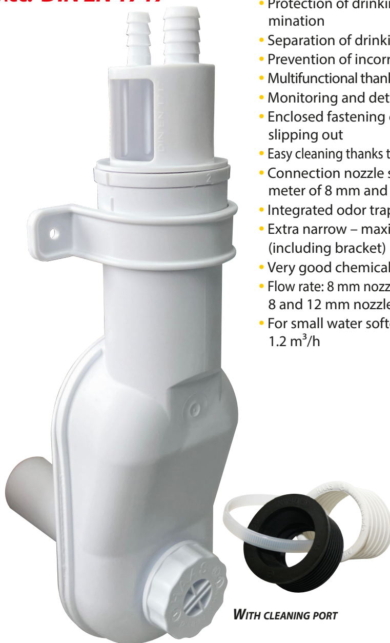
WITH CLEANING PORT