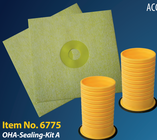
Item No. 6775 OHA-Sealing-Kit A

ACCORDING TO DIN 18534 SEALING IS MANDATORY!!!