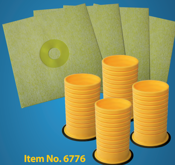
Item No. 6776 OHA-Sealing-Kit B