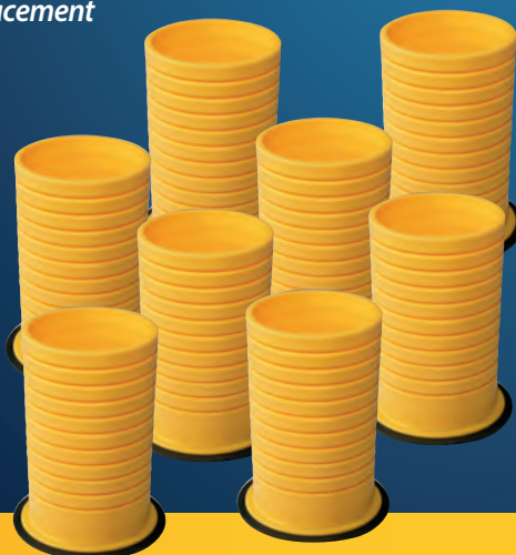
Item No. 6777 OHA-Sealing-Kit C