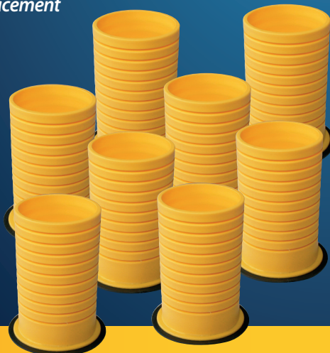
Item No. 6777 OHA-Sealing-Kit C