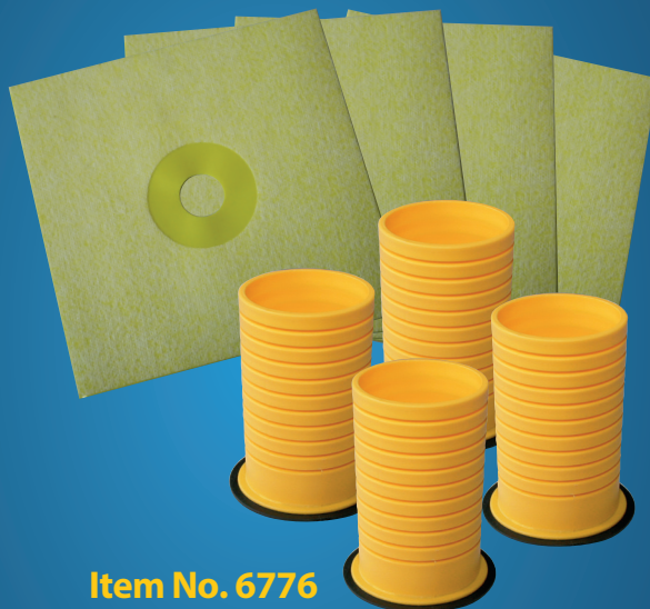
Item No. 6776 OHA-Sealing-Kit B