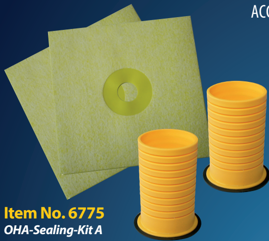
Item No. 6775 OHA-Sealing-Kit A

ACCORDING TO DIN 18534 SEALING IS MANDATORY!!!