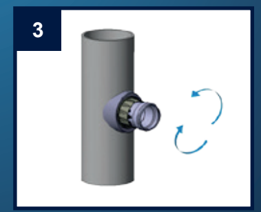
3. Tighten the nut - done !!!