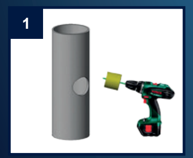
1. Drill the hole Ø 57 mm