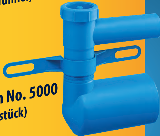
Item No. 5000 (Prüfstück)