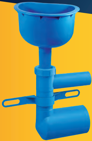
Item No. 5015 (funnel)

CHECK THE THIGHTNESS OF SEWAGE SYSTEMS ACCORDING TO DIN 1986-3