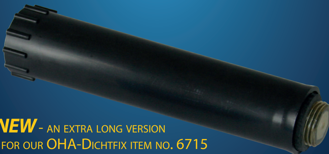
Item No. 3430

NOW NEW - AN EXTRA LONG VERSION WITH SEAL FOR OUR OHA-DICHTFIX ITEM NO. 6715 "LONGVERSION".